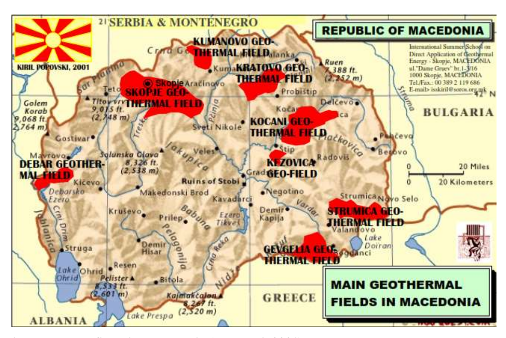
Figure 2: Main geothermal fields in Macedonia (Popovski, 2001).

Out of the seven geothermal fields identified in the east and northeast part of the country, four have been found to be very promising and three have been explored to the stage of possible practical use. Except the springs in Debarska banja and Kosovrasti, positioned in the West Bosnian-Serbian-Macedonian geothermal zone, all the others are located in the Central Serbian-Macedonian Geothermal Massif, Central and Eastern Macedonia (Figure 2).