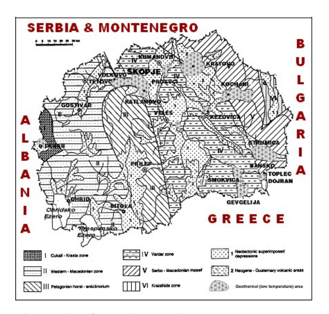
Figure 1: Geological settings and geothermal regions in Macedonia (Arsovski, 1997).

In the territory of Macedonia rocks of different age occur, beginning with Precambrian to Quaternary ones. Almost all lithological types are represented. The oldest, Precambrian rocks consist of gneiss, micaschists, marble and orthometamorphites. The rocks of Paleozoic age mostly belong to the type of green schists, and the Mesozoic ones are represented by marble limestones, acid, basic and ultrabasic magmatic rocks. The Tertiary sediments consist of flysch and lacustrine sediments, sandstones, lime-stones, clays and sands.